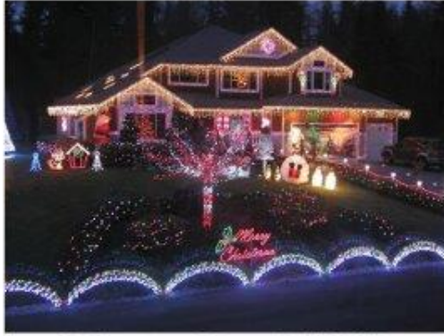
Must be a customer of Geneseo Municipal Utilities

4 Winners will receive a credit on their Geneseo electric bill!